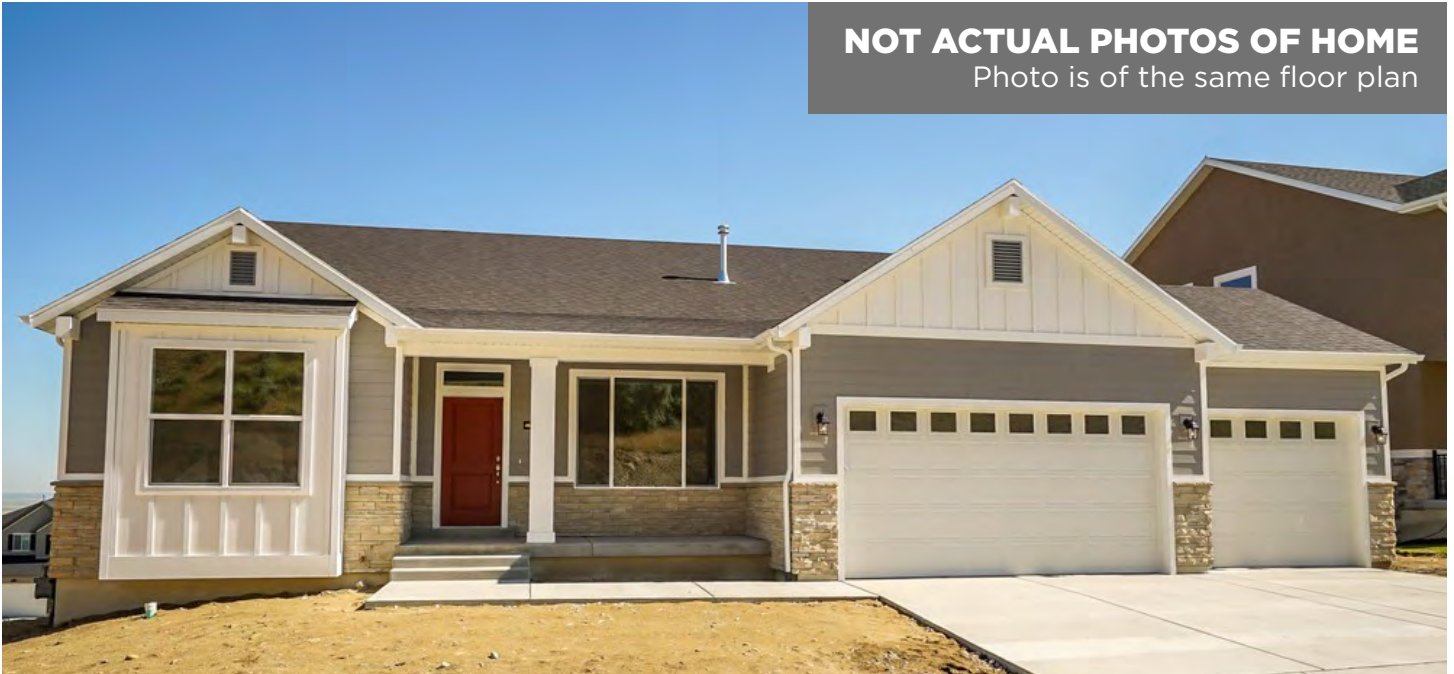
Photo is of the same floor plan

Gorgeous new home under construction! This craftsman-style home sits on a south-facing lot in a charming community. This is the perfect home plan for main-level living, featuring a large/open kitchen and family room making it great for entertaining both family and friends.